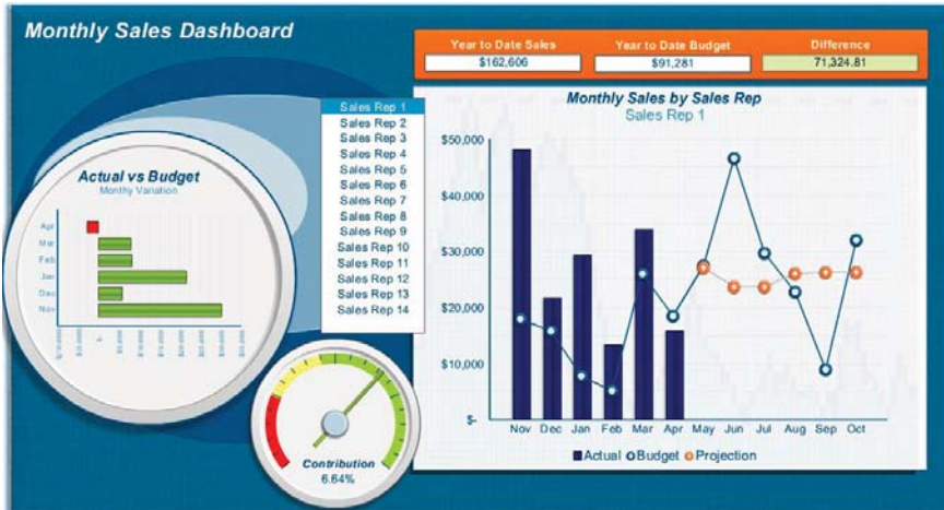
Figure 2: Sales Dashboard

that you're making decisions based on the most accurate data available – whenever or wherever you view the data.