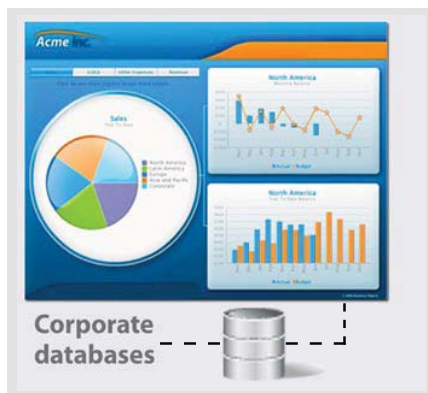
Figure 1: Sample Visual Model of Corporate Data

Best of all, SAP Crystal Dashboard Design, personal edition, updates models in real time. So you can be confident